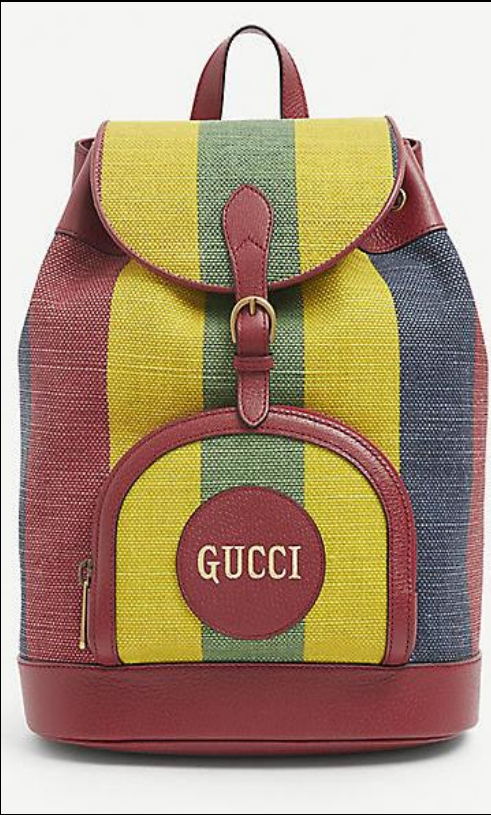
RETRO COLLEGIATE LOOKS